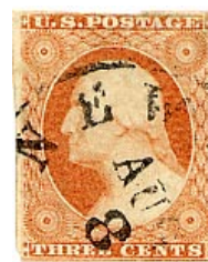
Orange Red Scott No. 11, 11A