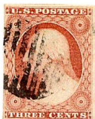
Dull Red Scott No. 11A