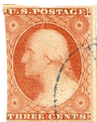
Yellowish Rose Red (pale & yellowish) Scott No. 11, 11A