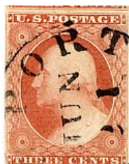
Yellowish Rose Red (medium & deep) Scott No. 11, 11A