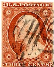
Orange Brown Scott No. 10, 10A