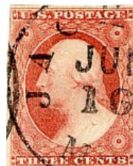
Rose Red/Bright Scott No. 11A