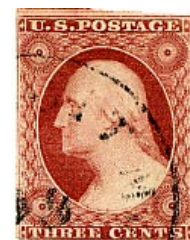
Claret/Deep Scott No. 11, 11A