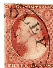
Claret/Purplish Scott No. 11, 11A