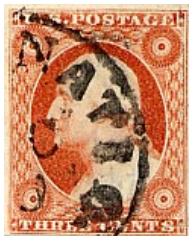
Experimental Orange Brown Scott No. 11A